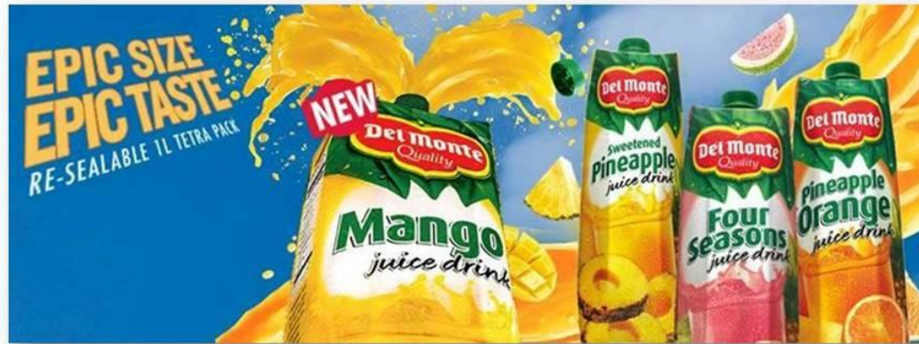
1-Litre carton format