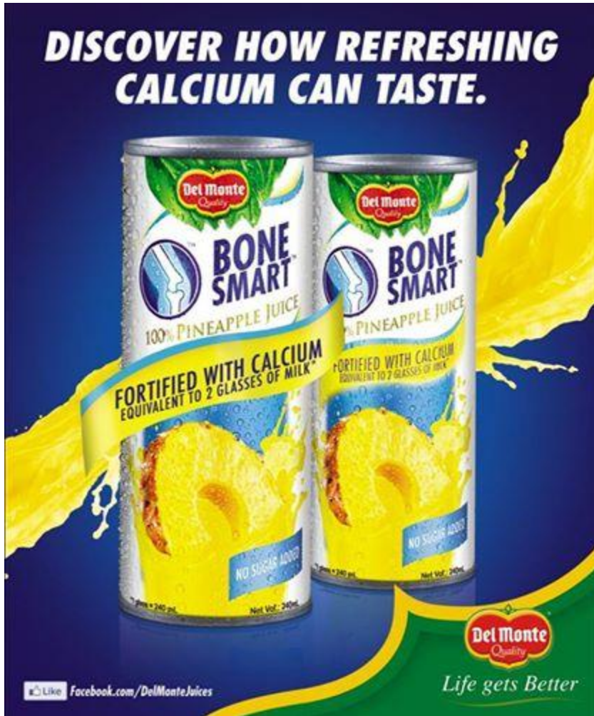
Pineapple juice fortified with calcium