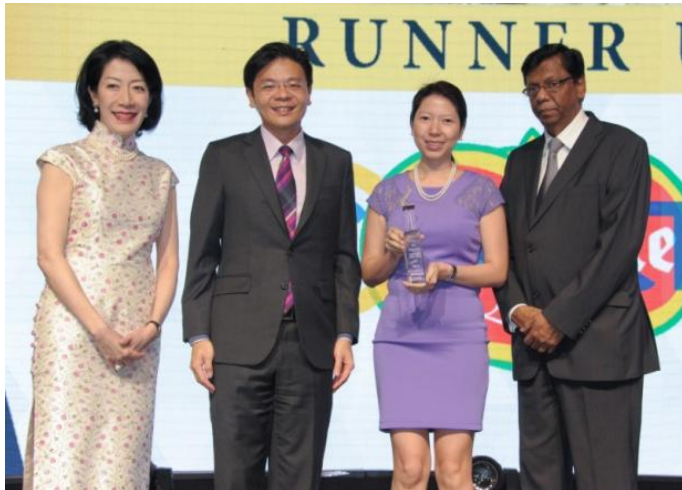
Won the Singapore Corporate Governance Award, Runner Up, at the Securities Investors Association Singapore (SIAS) Investors' Choice Award last 31 October 2014