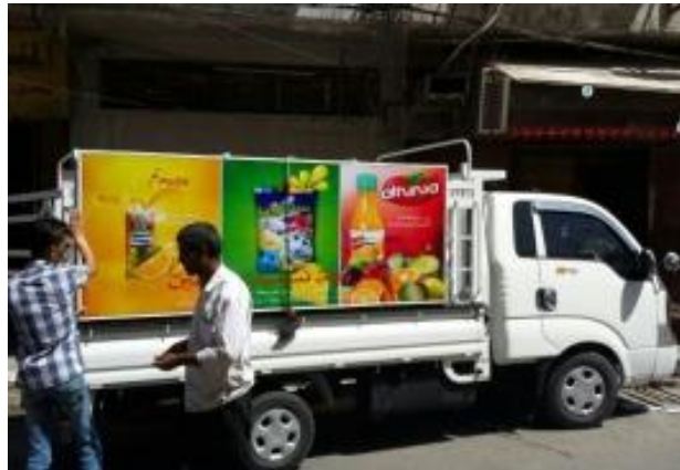
Co-branded truck & branded calendar in Iraq for key retailers