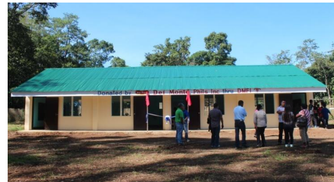
Donated classrooms to schools