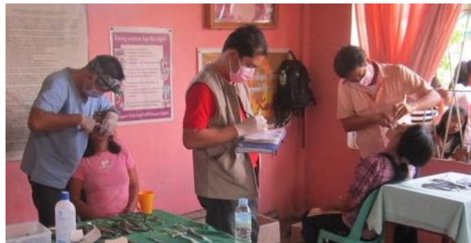
Conducted medical and dental missions with over 500 beneficiaries