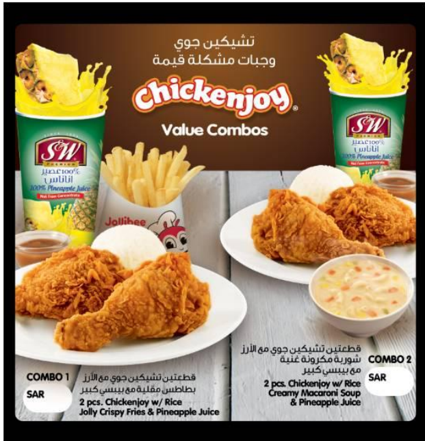
Co-branding S&W and Jollibee co-branded cup in Saudi Arabia, for our 100% Pineapple Juice