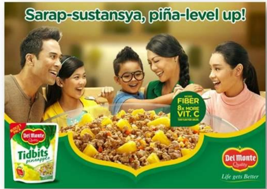
Deliciously-nutritious meal with pineapples