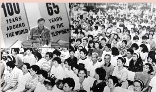
DMPI celebrates 65 years in the Philippines.