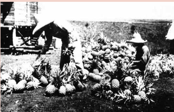
Experimental plot in Diklum (Bukidnon), 1926. Pineapple crowns from plot were gathered and planted as initial seeds.