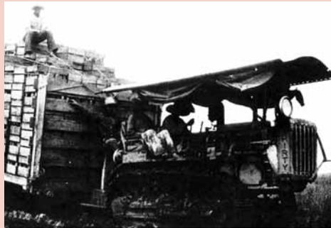
Mechanical farming starts at the Plantation, with purchase of US-made tractors and trucks.