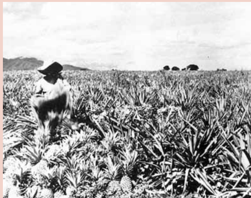
Surviving crowns are gathered and replanted to begin a new plant cycle.