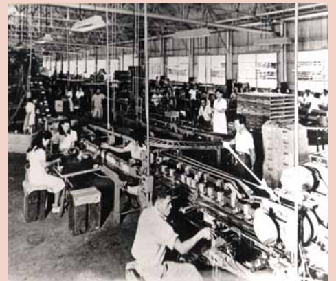
The Cannery gains new packing lines.