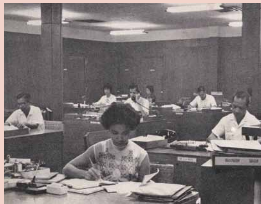
Philpack opens its Sales and Marketing offices in Intramuros (Manila).