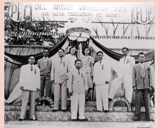
Workers celebrate Workers Day, highlighting worker unity.