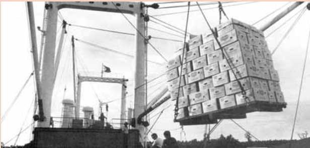
Philpack ventures into banana-growing for export, in the Davao and Misamis provinces.