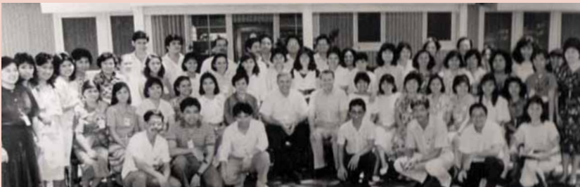
Administrative employees get together as the Bugo Main Office Building opens.