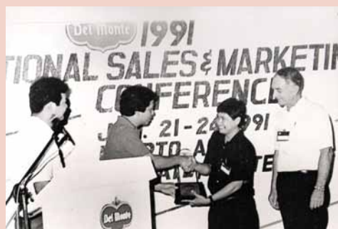
Manila-based Sales executives are honoured for outstanding performance.