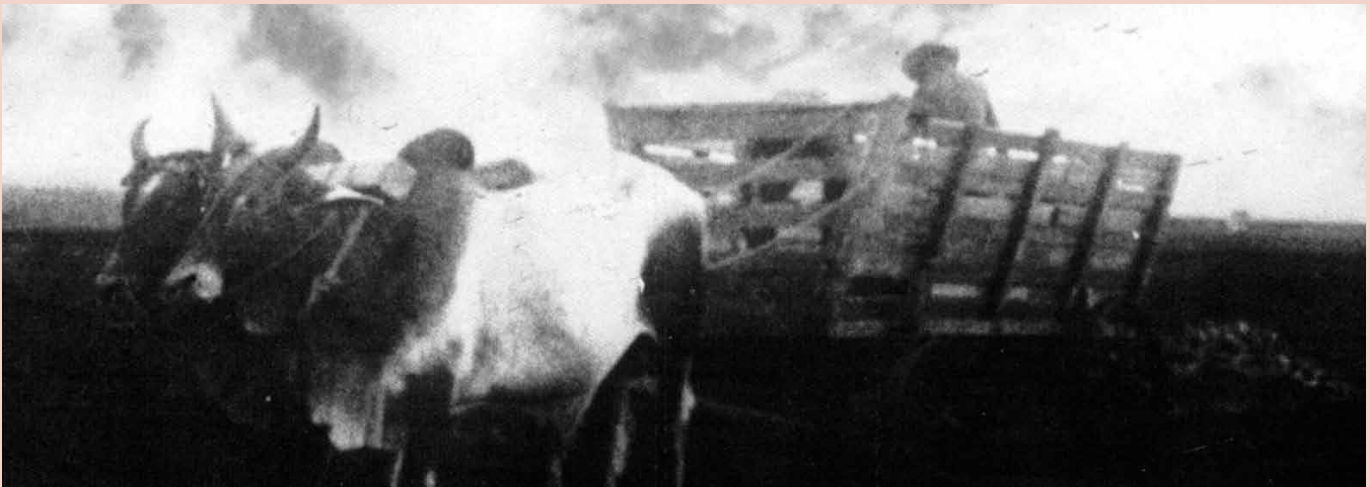
Ox-powered pineapple cultivation highlights Philpack's (now DMPI) humble roots in Bukidnon.