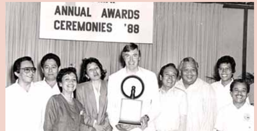
For the 2 nd time, DMPI is named Outstanding Employer by PMAP.