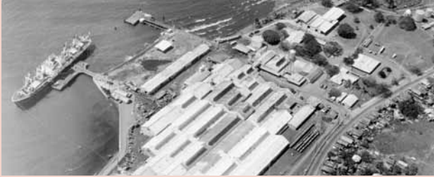
Cannery expands, with new can plant, processing lines for tomato, papaya and tuna, and a seaport.