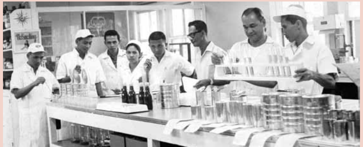
Quality checks are conducted on all processed products.