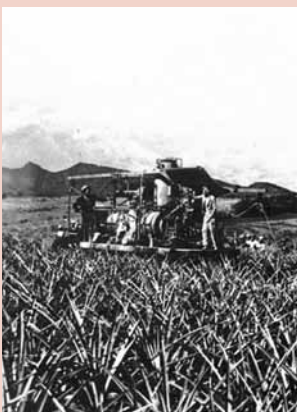
Further mechanisation improves yield.